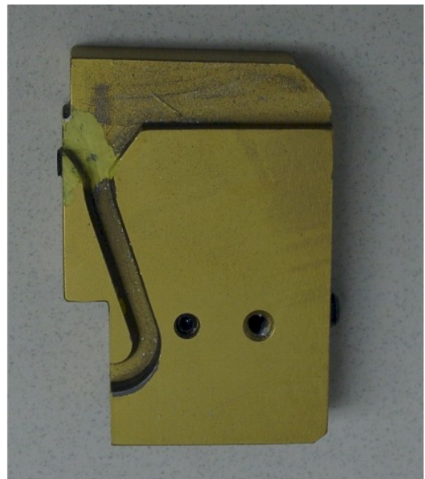
Curling Die after Repair